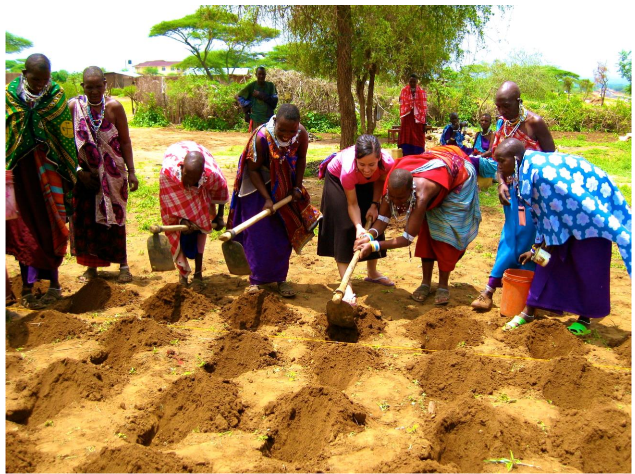
A GSC volunteer farming with Maasai women.