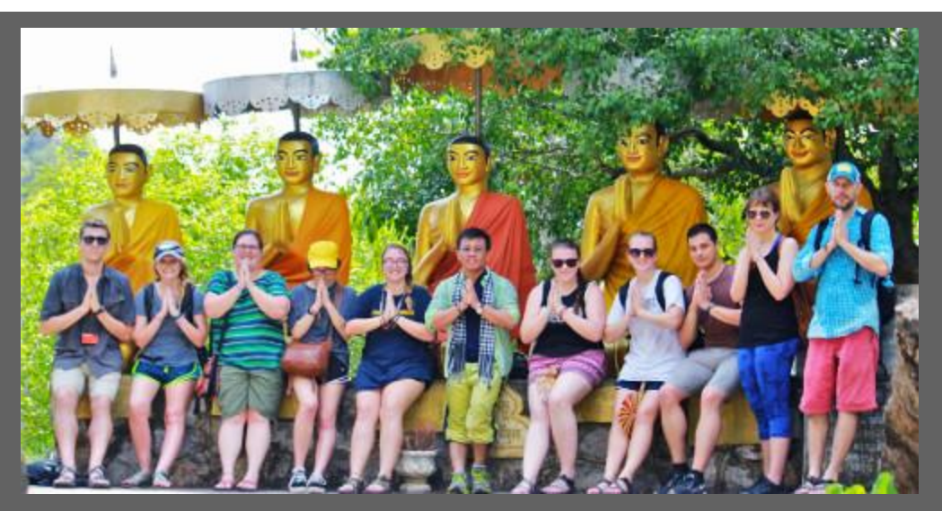
UTC students pose with the Cambodia In-Country Coordinator while visiting a wat (Buddhist monastery).

Hurry and take advantage of the chance to receive our current volunteer program prices before they increase! And don't miss out on this life-changing opportunity to volunteer and serve communities in need in Cambodia.