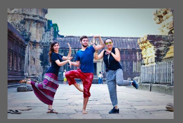
UAlbany students enjoy being tourists for a weekend at Ankor Wat while participating on the Spring Semester Program.